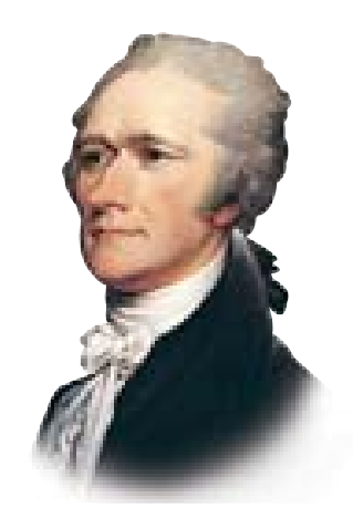
"They . . . divided the powers, that each [branch of the legislature] might be a check upon the other . . . and I presume that every reasonable man will agree to it."