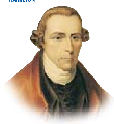
"You are not to inquire how your trade may be increased, nor how you are to become a great and powerful people, but how your liberties can be secured. . . ."

controversies over the constitution. The framers set up a procedure for ratification that called for each state to hold a special convention. The voters would elect the delegates to the convention, who would then vote to accept or reject the Constitution. Ratification —official approval—required the agreement of at least nine states. This system largely bypassed the state legislatures, whose members were likely to oppose the Constitution, since it reduced the power of the states. It also gave the framers an opportunity to campaign for delegates in their states who would support ratification.